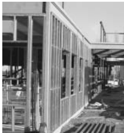
The superstructure of the West Shore Child, Youth and Family Centre begins to take shape in Colwood.