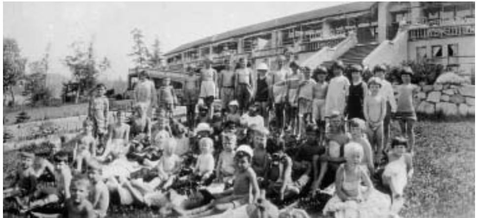
Children enjoy the waterfront at the original Queen Alexandra Solarium in Mill Bay.

South Vancouver Island District Women's Institute