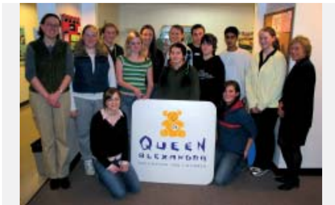
The 2004/05 Queen Alexandra Foundation's Youth Advisory Council