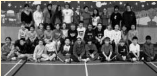
The Selkirk Montessori School kids that are raising money for equipment at the Queen Alexandra Centre.

This year our class decided that we wanted to help out other kids. We all love to run and play, and we have seen other children who have difficulties doing some of the activities that we enjoy. We felt that we could make a difference by raising money for the Queen Alexandra Foundation. To help us reach our goal, we have sold cupcakes, created a Haunted House for our school's fun fair, had a holiday raffle, and even told peoples' fortunes. In addition, we asked our school community to consider making donations to the