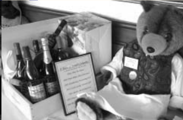
Jackson the Sommelier bear, sponsored by Angel Foods Restaurant Management.