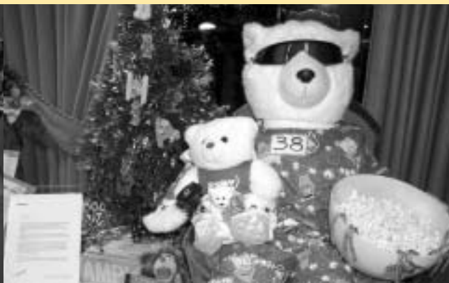
Shaw's DB the Digital Bear