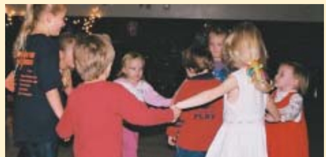
Kids from the Autism Program at the QAC, their siblings and the kids of the program staff dance together at the Autism Early Intervention Program Family Dance.

moving to the music and playing gleefully with the other children who were there. It was a wonderful, heart-warming experience for everyone – parents, staff and kids!