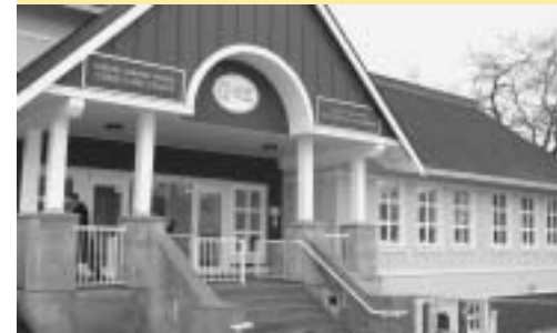
The new Cridge Village Child Care Centre.

The Queen Alexandra Foundation for Children is pleased to be a part of the official opening of the new Cridge Village Child Care Centre in Victoria. This beautiful new facility, located on Hillside Avenue, was funded in large part by $1,000,000 contributions from both the Queen Alexandra Foundation and the Harland Sanders Foundation.