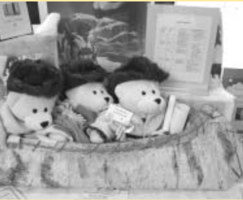
The Bay Gallery bears - winners of the Best Dressed and the Peoples Choice Award.